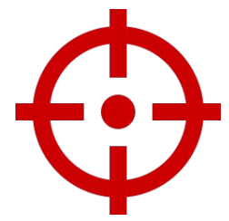
Key Knowledge about Portugal Tech market