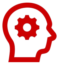
Experts in Technology and Tech Businesses