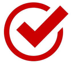
Fair Business Practices and Customer Alignment